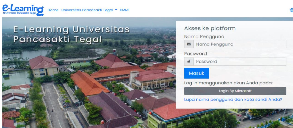
Figure 1: The main page of Elsakti