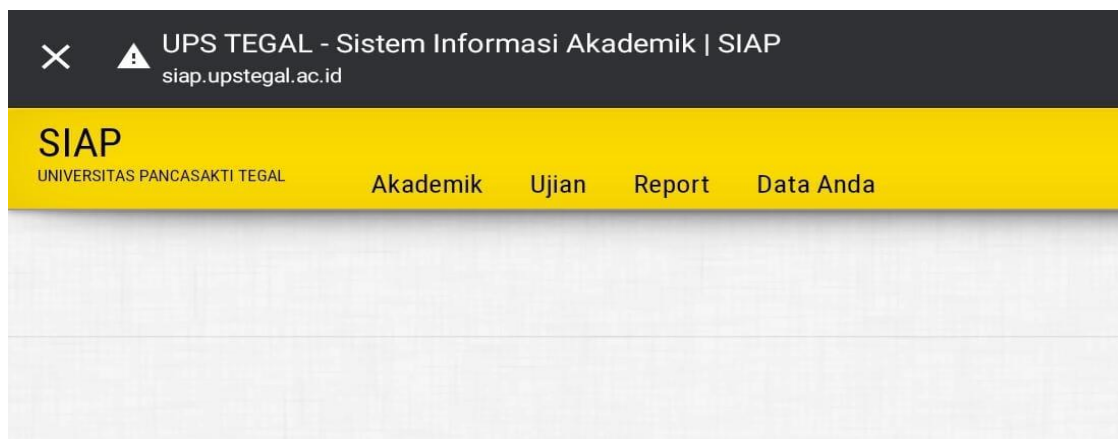
Figure 4: The main page of SIAP

The last example of the web-based platform developed by Universitas Pancasakti Tegal is SIAP. It is a website that can be accessed by university students as well as university staff. For university students of Universitas Pancasakti Tegal, the website of SIAP helps them with academic concerns such as checking schedules, filling in course selection sheets, viewing exam schedules, viewing the reports of course selection sheets and course result sheets, as well as other financial concerns. Meanwhile, the website of SIAP is also very helpful for university staff of Universitas Pancasakti Tegal. It allows the staff to check teaching schedules, process course selection sheets, as well as to upload the students' course results. From the aforementioned features of SIAP website, it further also makes the academic processes more effective and efficient, especially in terms of saving time and being paperless.